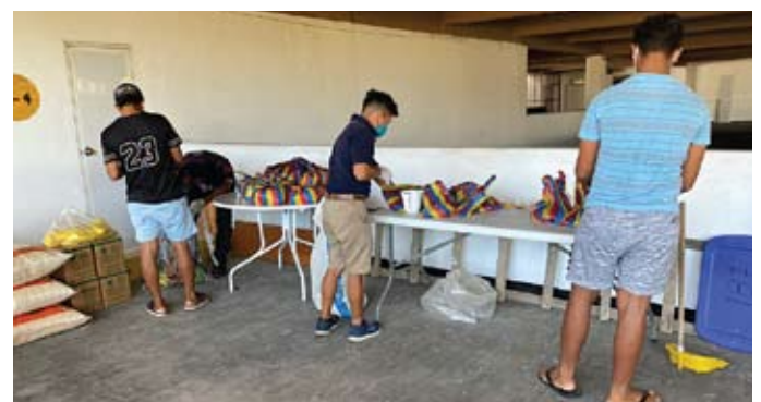
Joint effort to compile and distribute about 3,000 food packages for people in need

nirs, textiles etc. at the beach. Suddenly they were out of work and without income. They don't have any savings, some of them even didn't get the promised support of 60 USD per family and month. The country is about to run bankruptcy. Maladministration, corruption and low oil costs, which are disastrous for an oil exporting country, are the main reasons.