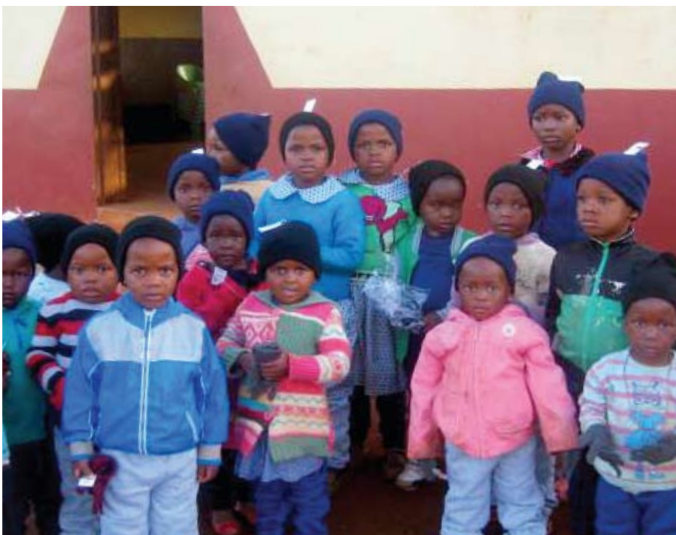
Warm clothes to protect against the cold in winter

it can get very cold in eSwatini in winter above all at night. Children going hungry and wearing only insufficient clothes while lying on the cold ground in a cottage made of clay, that's certainly a picture nobody likes. For this reason apart from food, this kind of support is of vital importance as well.