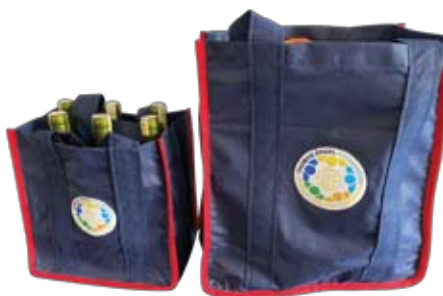
Fabric bags manufactured in Ecuador. The profit is determined to buy food as well