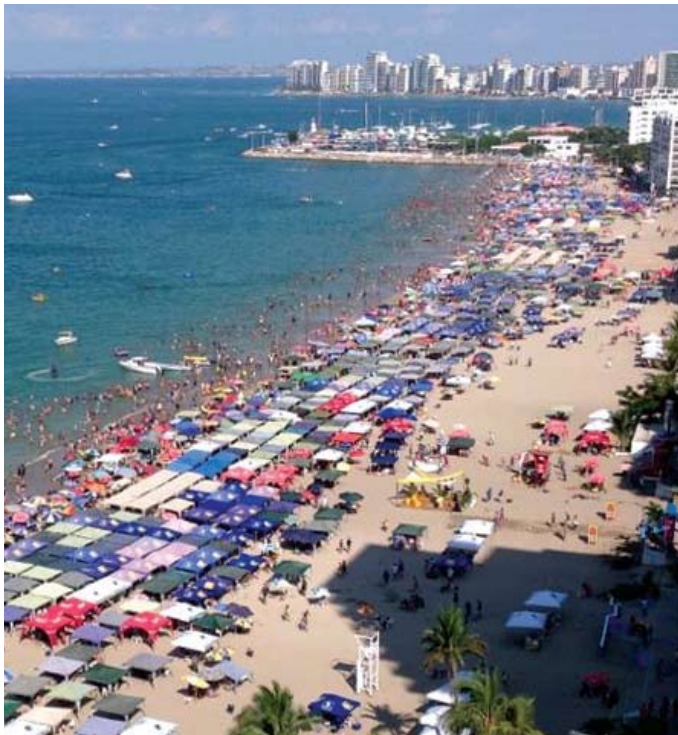
Normally the beaches are covered by tourists