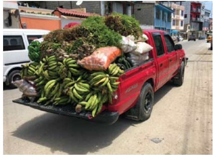
Pick-up with special permit