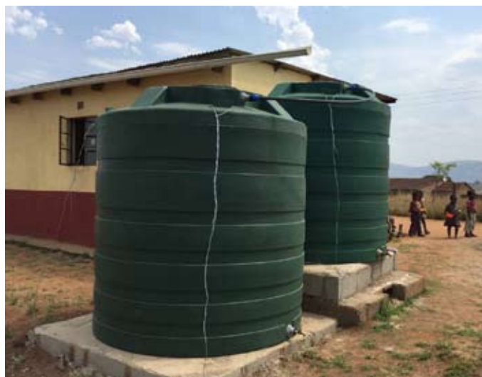
NCP with 2 tanks