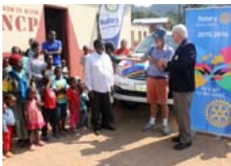
Ambulatory Vehicle Donated by the Rotary Clubs