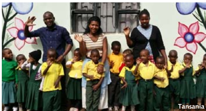
The Flowers Children's Centre takes care of about 90 children