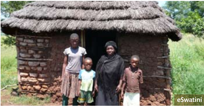
Typical cottage of a family where either both parents or one parent have died

After a careful inventory of all activities of Hand in Hand Swaziland we quickly realized that we had been able to increase the efficiency and quality of the different supporting measures without investing more money.