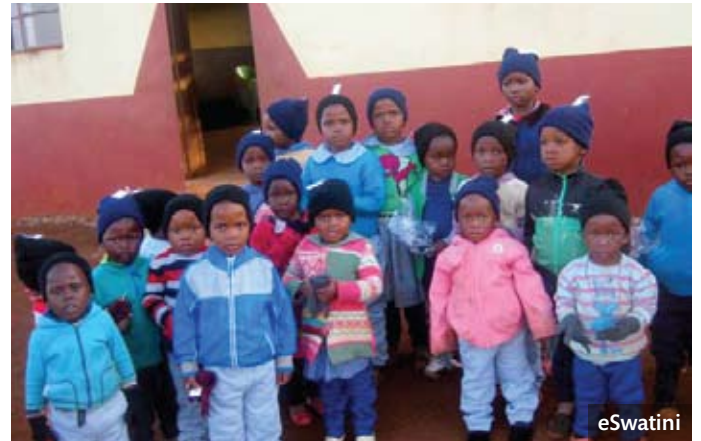
Warm clothes to keep warm in the cold months of winter

Moreover, in 2015 the campaign “winter clothes” was launched as even in southern Africa temperatures can be extremely low above all in May, June and July.