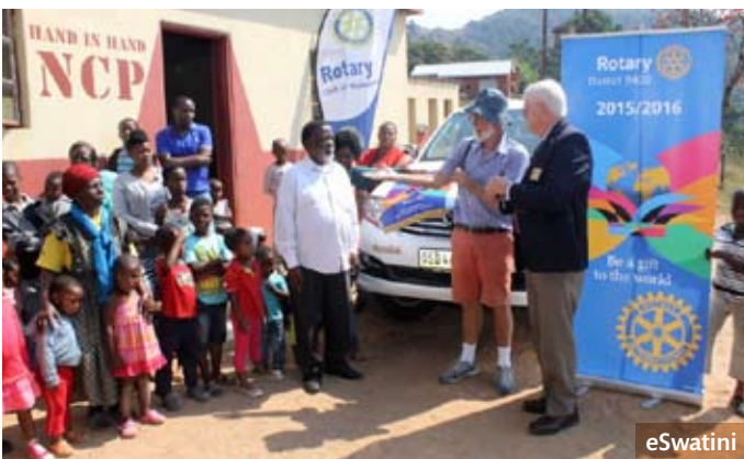
Handover of another vehicle for mobile medical support

Rotary Club Sankt Goarshausen-Loreyley donated an ambulance being supported by the partner club in Martin/Slovakia and Rotary International as well as Rotary Club Mbabane/Swaziland .