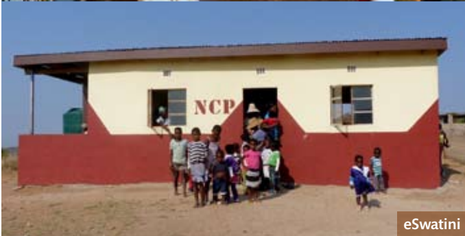
Picture above: mobile medical supply Picture below: one of about 100 NCPs

Rotary Club Sankt Goarshausen-Loreyley donated an ambulance being supported by the partner club in Martin/Slovakia and Rotary International as well as Rotary Club Mbabane/Swaziland .