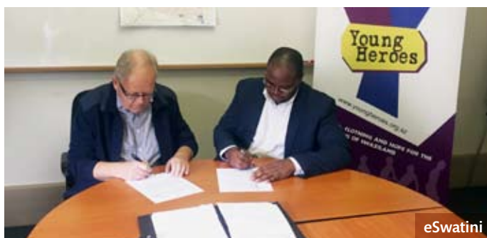
Partnership with Young Heroes set out in writing

In Swaziland we had found a new partner called Young Heroes enjoying great reputation. We had to finish the collaboration with Hand in Hand Swaziland (HiH SZ) since they didn't manage to realise our ideas of professional and effective development aid. Moreover, after we had made much effort to find out more about HiH, we established that the organisation had already been deeply in debt before we assumed responsibility for them. For this reason the break up was inevitable. Under the umbrella of Young Heroes the aid project with the new name Litsemba could be continued to the full extent. Four ambitious and loyal staff members of the previous partner were taken over and provided for a smooth transition.