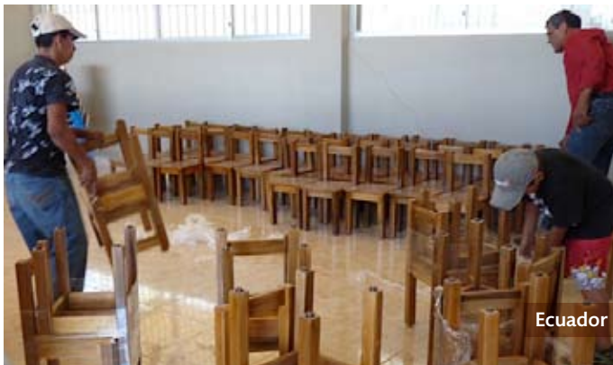
New furniture for school Las Minas

The cottages of the primary school Las Minas in the immediate vicinity were replaced by solid building as well. We supported the project buying solid tables and chairs manufactured by a local carpenter.