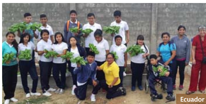
Salads cultivated by the Melvin Jones to provide for a better diet

In Ecuador the support of the Melvin Jones facility , taking care of disabled people, was continued. The same applied to the support of Helping Kids in Ecuador .