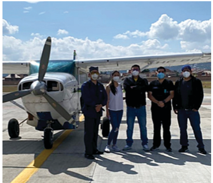
Ready to take off for the Amazon Region