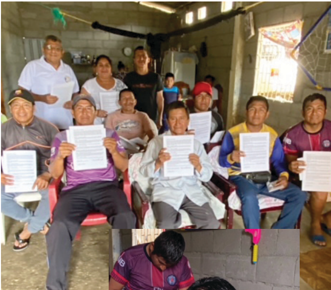
Farmers signing micro loans